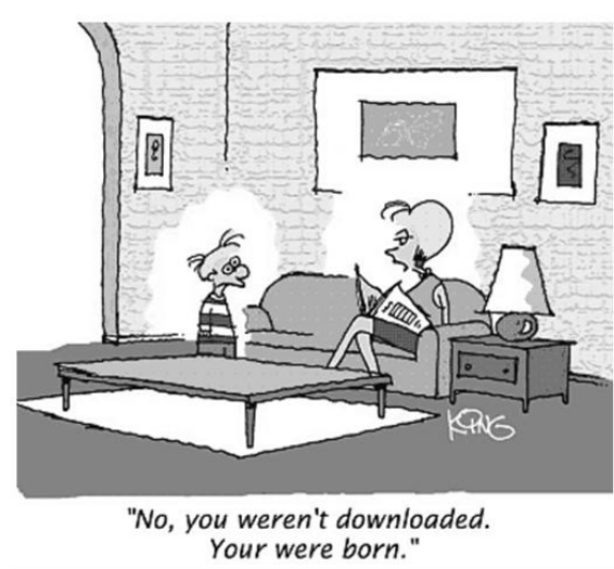
Figure 1. A typical figure

Figure and table captions should be centered if less than one line (Figure 1), otherwise justified and indented by 0.8cm on both margins, as shown in Figure 2. The caption font must be Helvetica, 10 point, boldface, with 6 points of space before and after each caption.